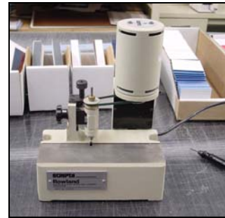
A Roland Scripta Beveler.

The purpose of beveling in many applications is to hide the unsightly edge of sheet materials that have been saw cut or sheared. Aesthetically, the look of a finished sign, wall or desk plate can be improved with this process. Adding a bevel to the edge provides a picture frame effect that can enhance the overall appearance. The standard bevel on a plate is usually 45 degrees, starting at the midpoint of a 1/16-inch piece of engraving stock. This is determined by the angle of degree of the beveling cutter. Many engravers like a slightly broader bevel and will make a deeper cut to achieve this look.